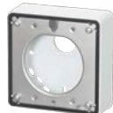
WV-QJB500-W Mount Bracket