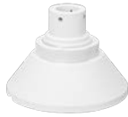
WV-QSR506S-W Mount Bracket