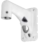
WV-QWL501S-W Wall Mount Bracket