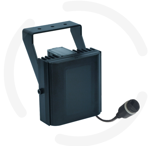
Interchangeable Diffuser Lens