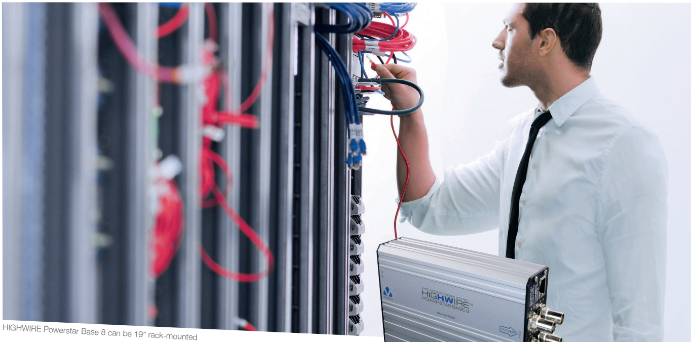
HIGHWIRE Powerstar Base 8 can be 19" rack-mounted