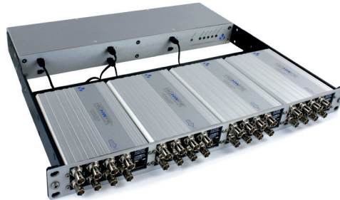
Rackmount | Four rack-mounted HIGHWIRE Powerstar Base 8 units assembled with a Veracity 1U PSU.