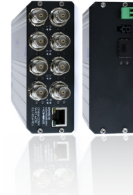
Front | 8 coax links with status LEDs, plus a Gigabit uplink port.